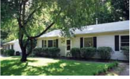
Bacharach Community Shelter for Single Mothers and their Children Westport