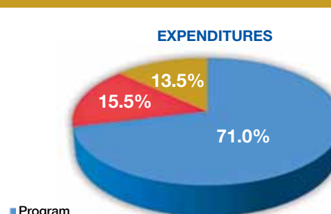
General & Administration

For a copy of our audited statements, please call, or visit our website: www.hwhct.org