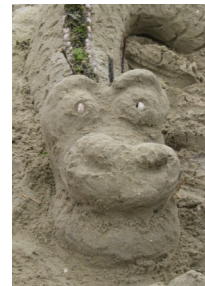
Above: Sami the sea serpent, winner of People’s Choice & Golden Shovel