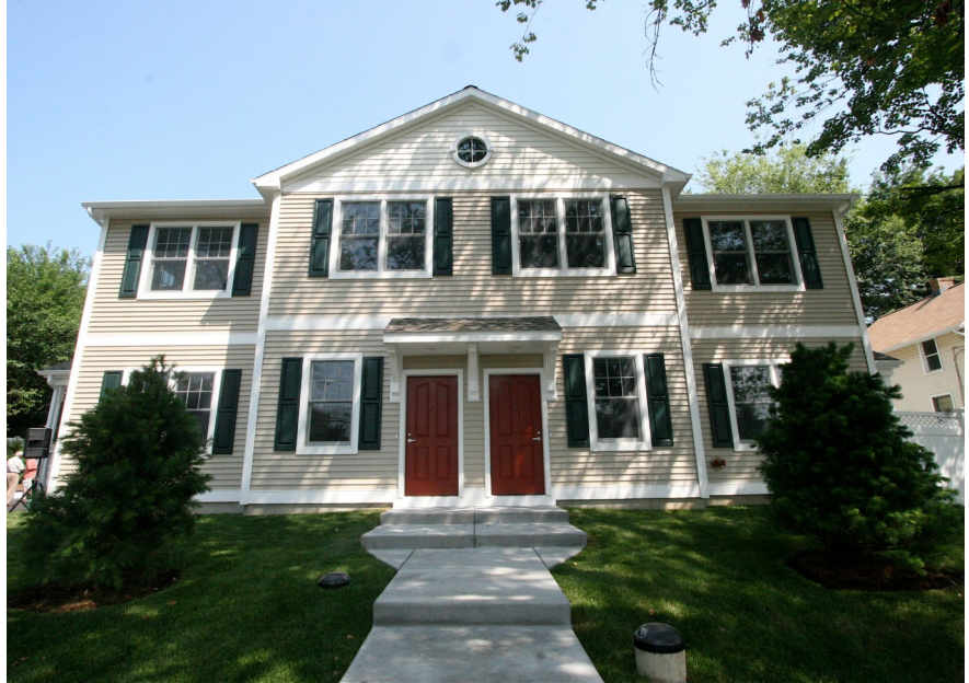
Westport Rotary Centennial House