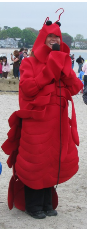
The Castles Lobster

Homes with Hope/IHA celebrated the 8th Annual Castles in the Sand build-athon at Compo Beach on Saturday, May 16th. Despite the less than perfect weather, there was a large crowd of enthusiastic teams who came to build a sea serpent, an octopus, a giant hotdog and hamburger, and a bowling alley to name