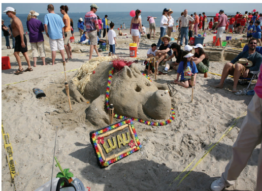
Luau Pig: One of last year's fabulous creations

As the weather outside warms up, we here at IHA HQ are dusting off our trowels and practicing our molding skills on small mountains of spent coffee grounds in anticipation of Interfaith Housing's 7th Annual Castles in the