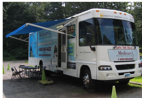
The mobile DSS office

programs (as well as referrals from Westport, Wilton, and Weston Social Service Departments) by eliminating