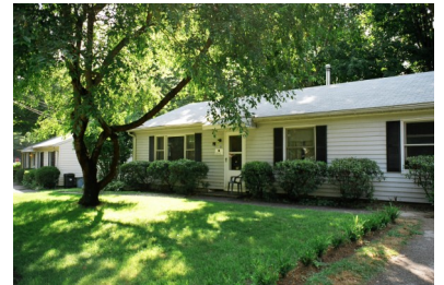
Bacharach Community Emergency Shelter for Single Moms and their Children