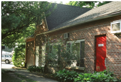
Gillespie Center & Hoskins Place Emergency Shelter for Single Men and Women