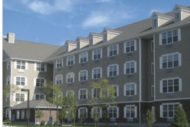
Fair Street Apartments Permanent Supportive Housing