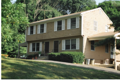
Saugatuck Apartments Permanent Supportive Housing