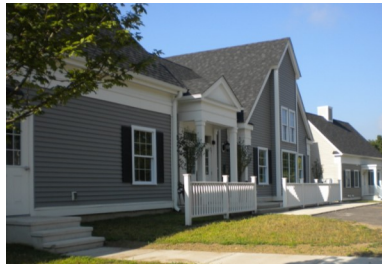
Hales Court Permanent Supportive Housing