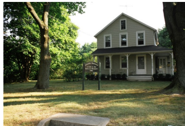
Linxweiler House Extension of Bacharach Community