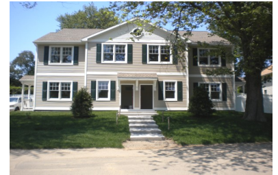
Westport Rotary Centennial House Permanent Supportive Housing