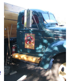
The Big Green Truck

groups reinforced the positive experience that families, congregations, offices, and service clubs have when they volunteer their time, efforts and talent at the Kitchen. They have loyally served our residents for 28 years. The tradition continues in many ways, and our residents are grateful for all the effort!